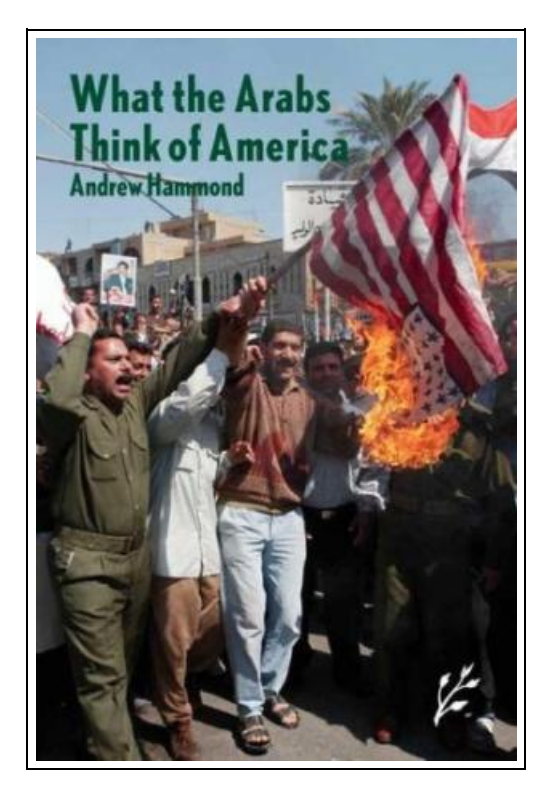
Filesize: 5.13 MB