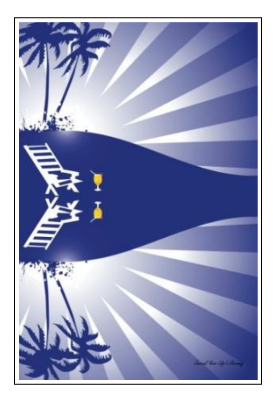
Filesize: 1.78 MB