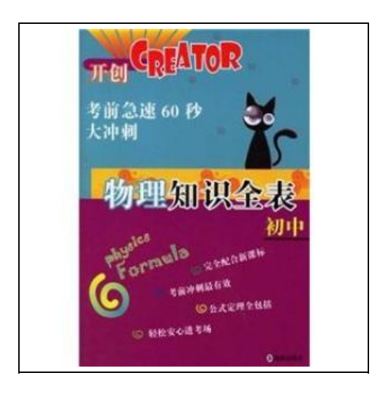
Filesize: 5.17 MB