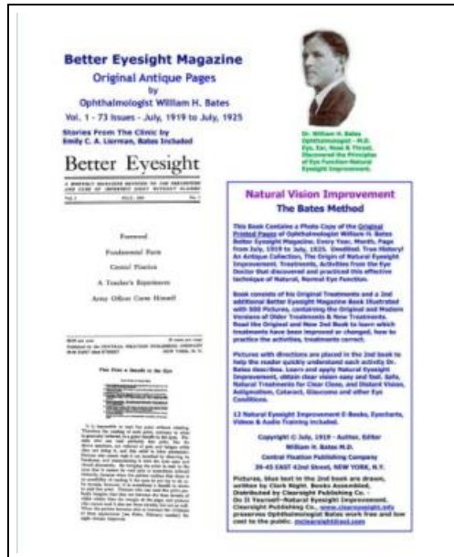
Filesize: 9.2 MB