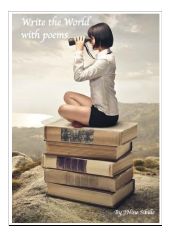
Filesize: 9.24 MB