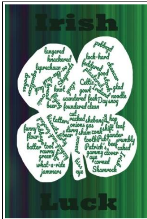
Filesize: 5.89 MB