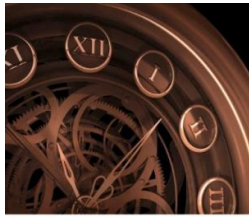
FOOD INVESTIGATION, VOLUME 5