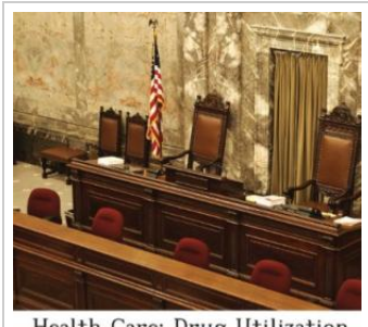
Health Care: Drug Utilization Review Under Medicare: T-PEMD-89-5

U.S. Government Accountability Office (GAO)