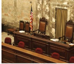
Highlights of a GAO Forum: Global Competitiveness: Implications for the Nation's Higher Education System: GAO-07-135SP