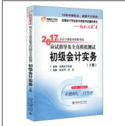
Filesize: 1.7 MB