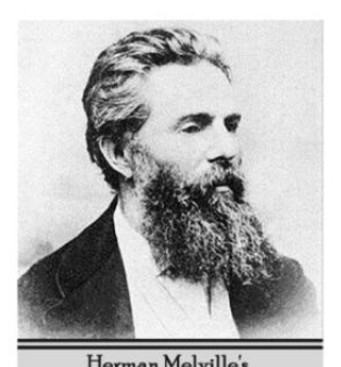
Herman Melville's Battle Pieces And Aspects Of The War "At the height of their madness, The night winds pause, Recollecting themselves, But no lull in these wars."