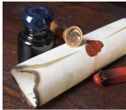
FOOD INVESTIGATION, VOLUME 4