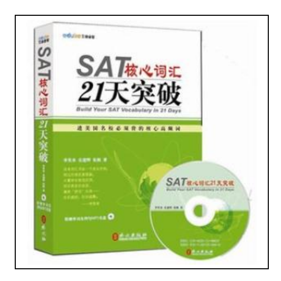
Filesize: 7.67 MB