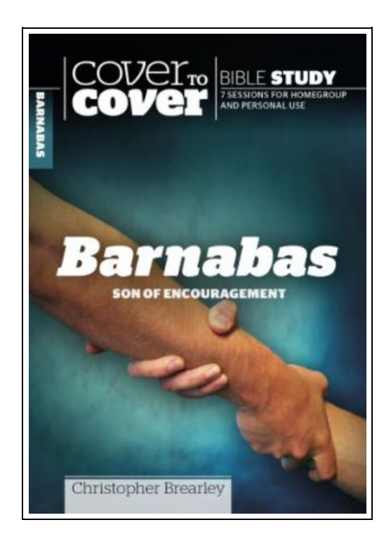
Filesize: 4.55 MB