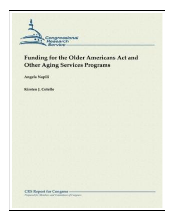
Filesize: 2.1 MB