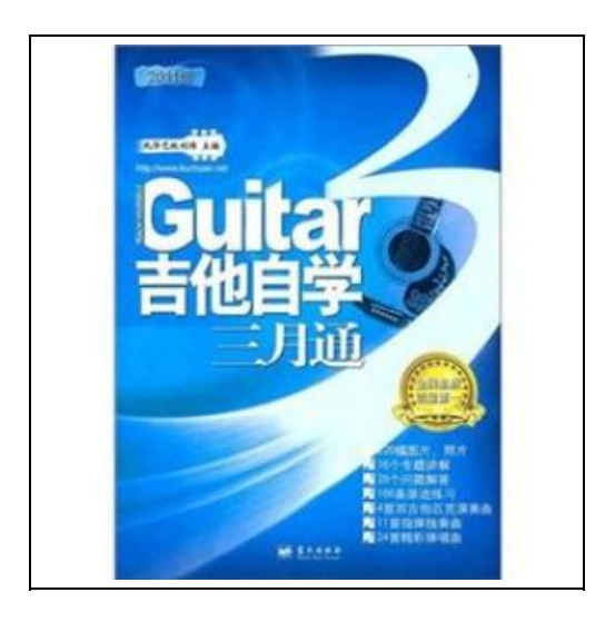
Filesize: 6.29 MB