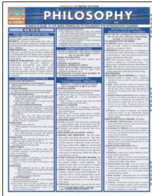
Filesize: 7.76 MB