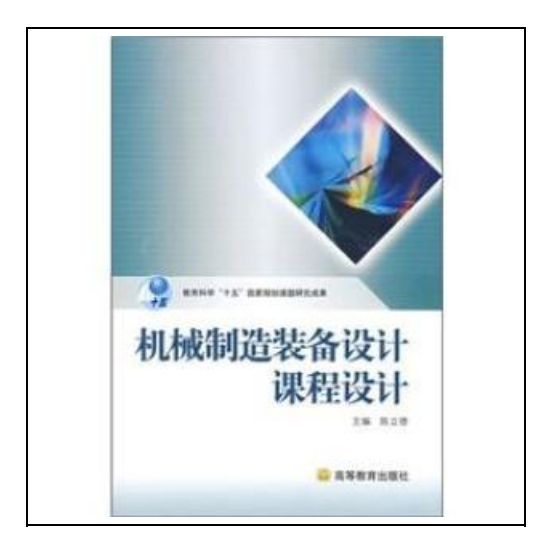
Filesize: 6.48 MB