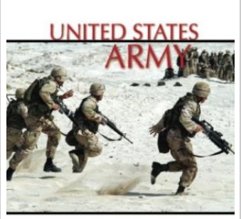
POCKET MONTHLY PLANNER 2017