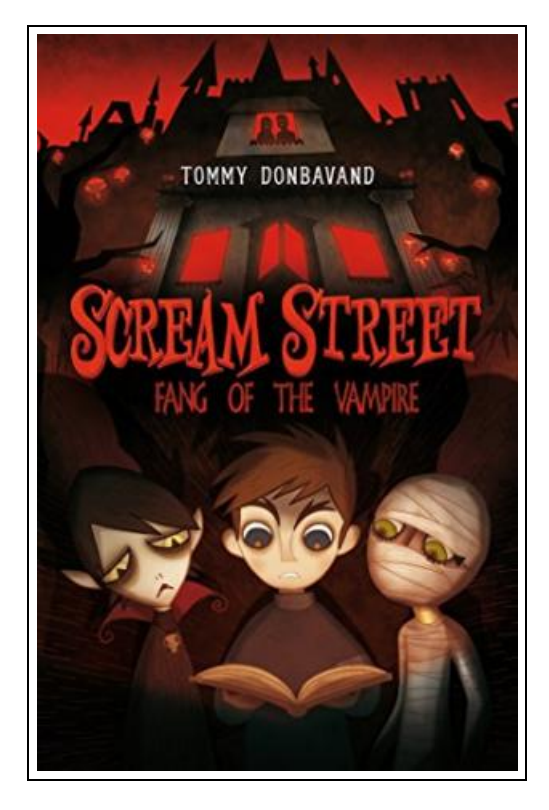
Filesize: 9.14 MB