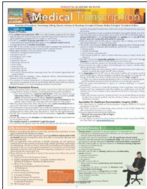
Filesize: 1.44 MB