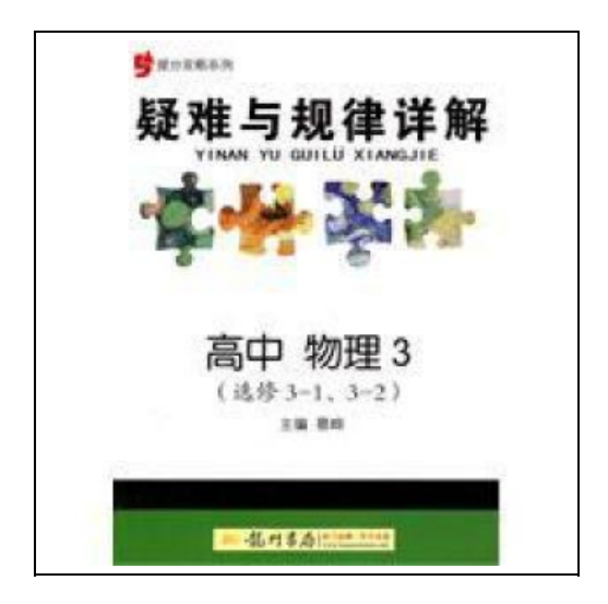
Filesize: 2.22 MB