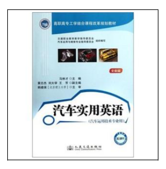
Filesize: 2.52 MB