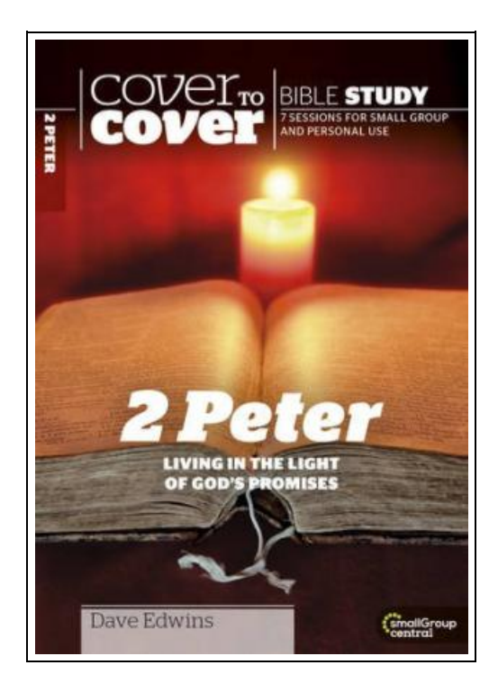
Filesize: 8.98 MB