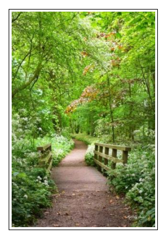
Filesize: 2.15 MB