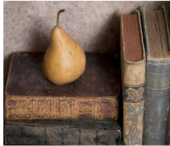
DENTAL DIGEST, VOLUME 21...