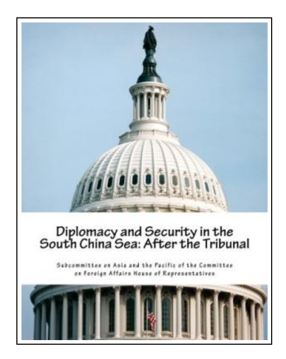
Filesize: 9.42 MB