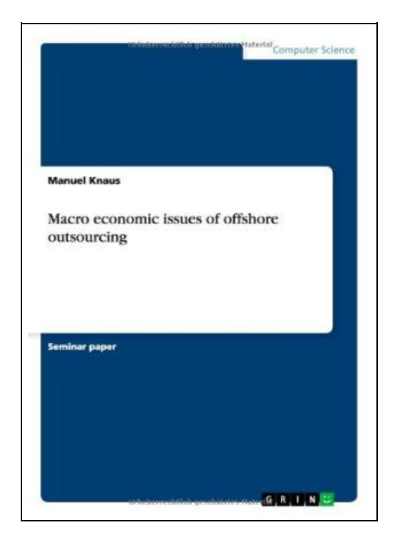
Filesize: 8.62 MB