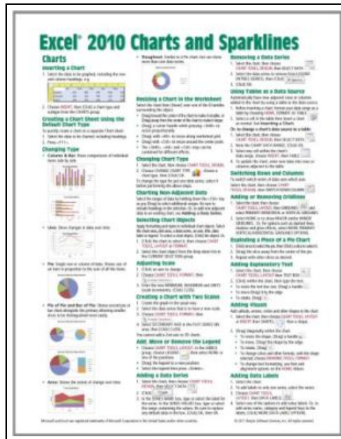
Filesize: 1.11 MB